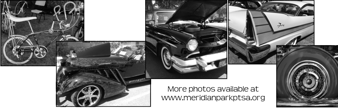
More photos available at www.meridianparkptsa.org

What a great day for a Car Show! Hundreds of people enjoyed the weather and fun at the 2013 Shoreline Classic Car Show on August 4. Almost $8,000 was raised for Meridian Park!